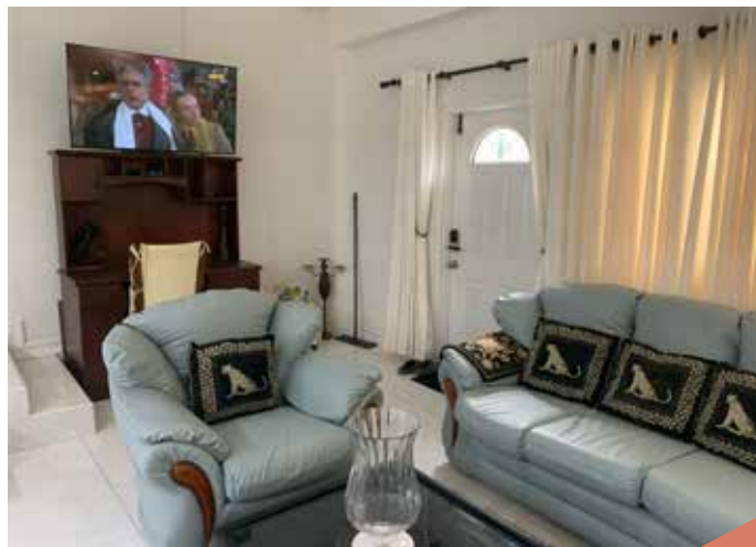
Comfortable and spacious living room