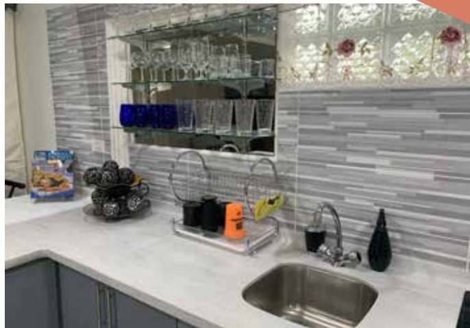
Well appointed kitchenette