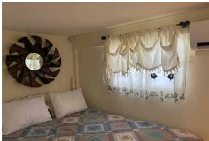
Bedroom with queen size bed